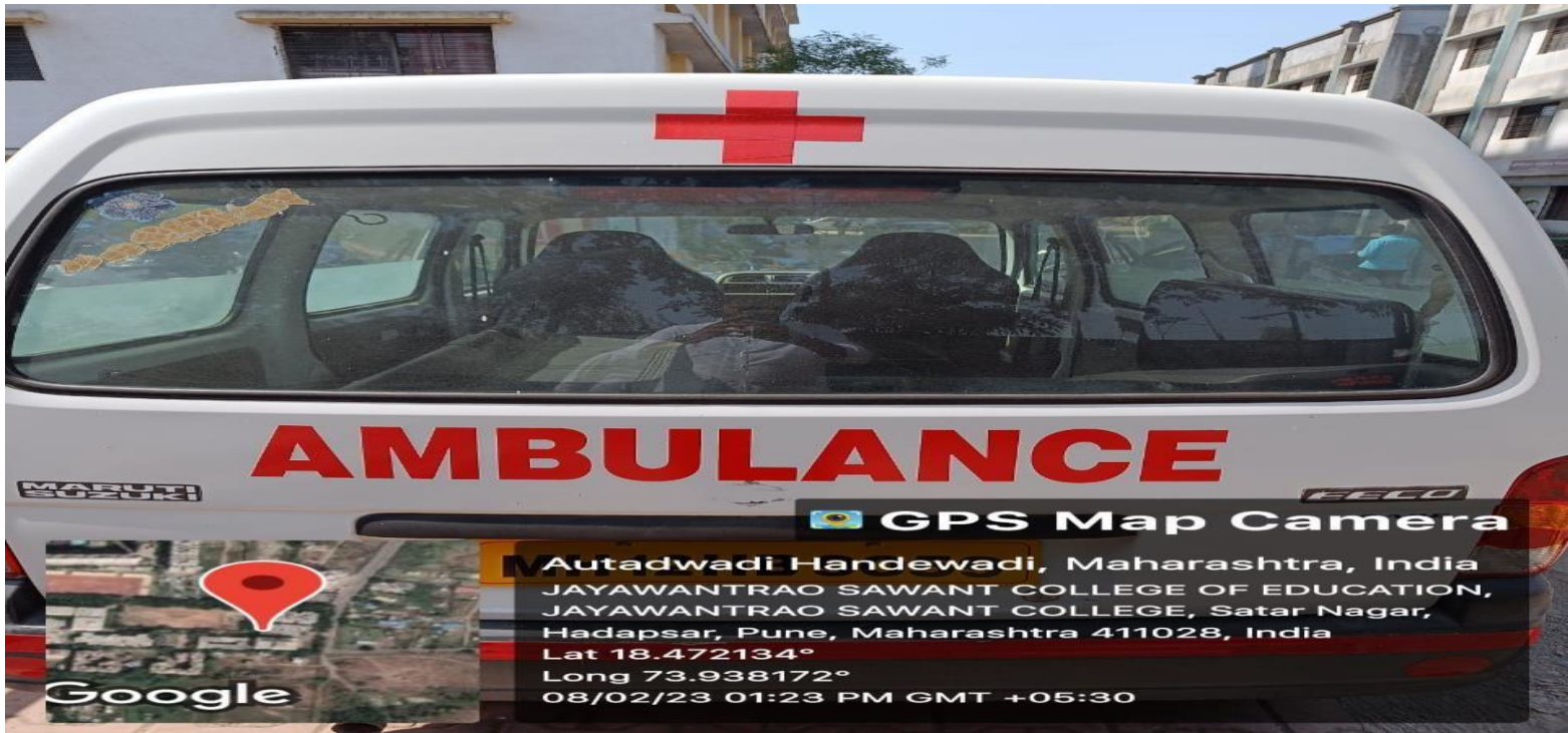
Glimpses of Ambulance with Stretcher & Wheelchair