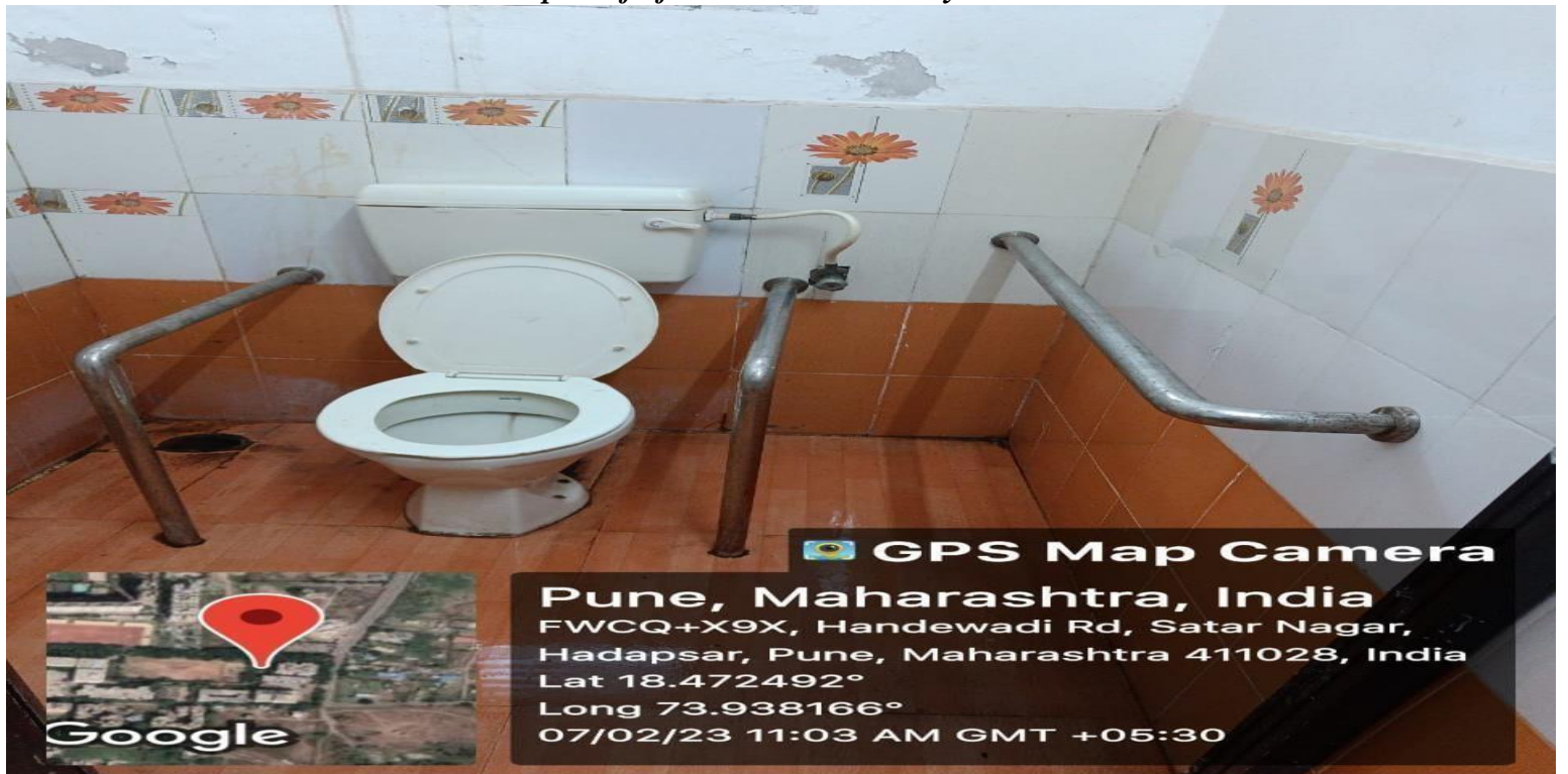
Glimpses of lift & Disabled Friendly Washrooms

GPS Map Camera Pune, Maharashtra, India FWCQ+X9X, Handewadi Rd, Satar Nagar, Hadapsar, Pune, Maharashtra 411028, India Lat 18.472492° Long 73.938166° 07/02/23 11:03 AM GMT +05:30